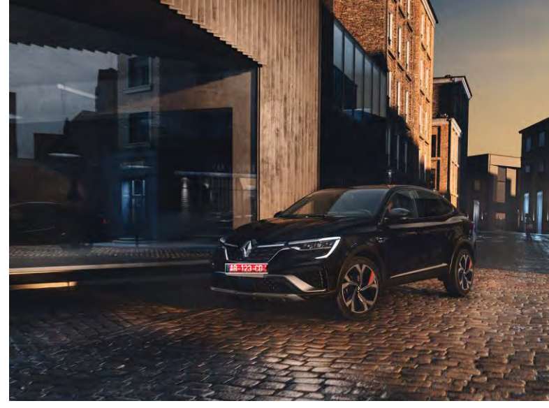
Have a good trip in Europe!